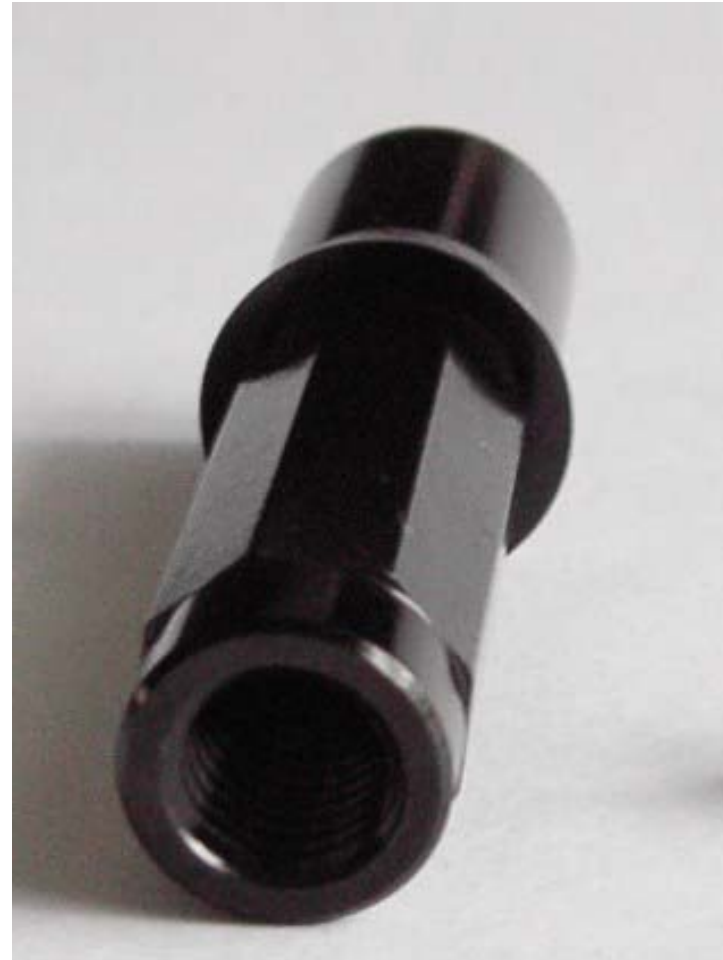
Dynacraft Prophet ICT Adapter Sleeve (Right)