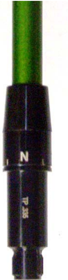
TaylorMade R9 Adapter Sleeve With ferrule (Left)